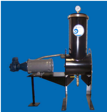
Model 1175-10 (10 GPM)