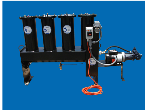
Model 4175-40-ABB (40 GPM)