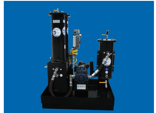
Model 2175-20-ABB-B (with bag filter housing)