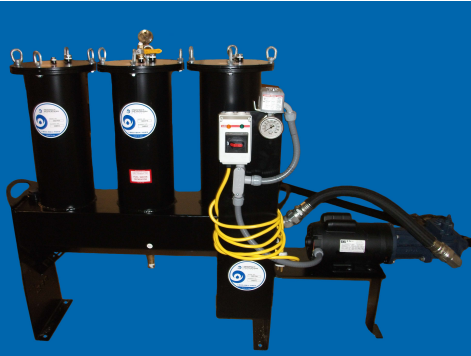
Model 3175-30-ABB (30 GPM)