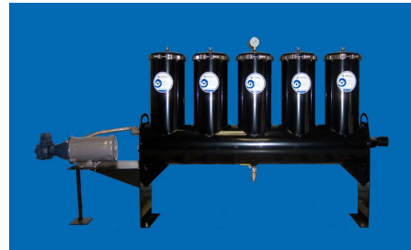
Model 5175-54 (54GPM)