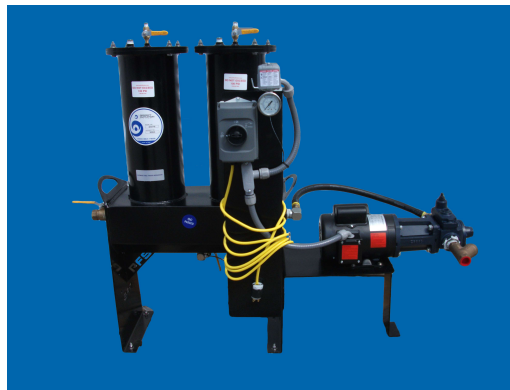
Model 2175-20-ABB (20 GPM)