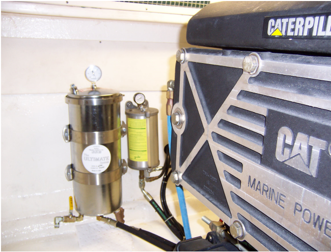
Model 290V Stainless Steel