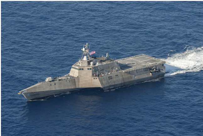
Model 290V install for the U.S Navy